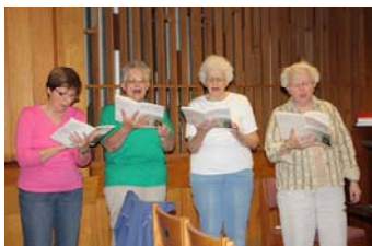
Three Altos & a Soprano

The Adult Choir starts its weekly rehearsals Thursday, September 8, at 7:30 p.m. in the Choir Loft. Sopranos, altos, tenors and basses are most welcome to join. No audition required.